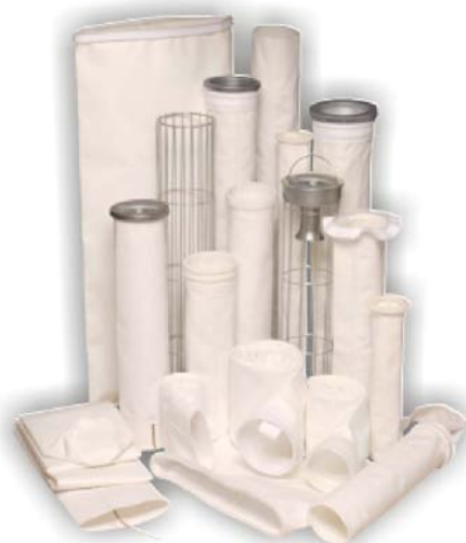
Dust Collection Filter Bags