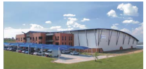
Donaldson Longmeadow distribution centre, Gauteng