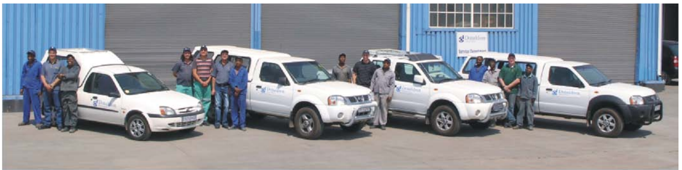
Donaldson service teams

Donaldson incorporated the industrial air service department full time in 2004. Today, the Donaldson Service team consists of highly trained technicians and with the backing of the technical division, offers over 100 years combined experience. Trailers which are fully kitted with equipment to perform repairs, are assigned to every service team and emergency spares stock is always available. Our standby technicians are available 24/7/365.