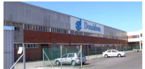
Donaldson factory in Epping, Cape Town